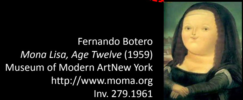
Fernando Botero Mona Lisa, Age Twelve (1959) Museum of Modern Art New York http://www.moma.org Inv. 279.1961