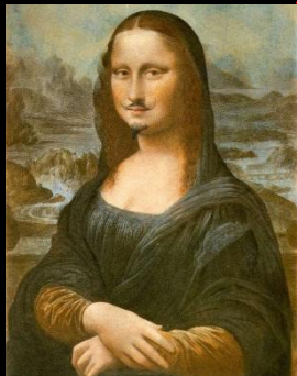
Marcel Duchamp L.H.O.O.Q. (1930) Musée National D'Art Moderne, Paris http://www.centrepompidou.fr Inv. AM 2005-DEP 2

<lido:relatedWork> <lido:objectID> ??? </lido:objectID> </lido:relatedWork>