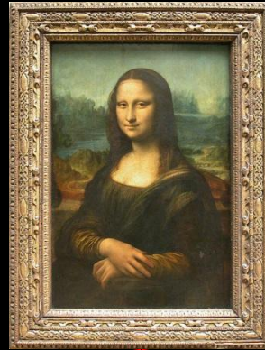
Leonardo da Vinci Portrait of Lisa Gherardini (1503-06) Louvre, Paris http://www.louvre.fr Inv. 779